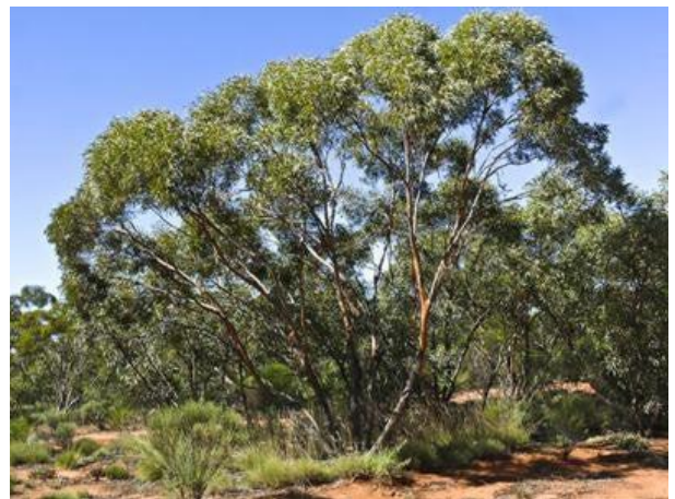
Example of Australian Red Mallee tree that produced the burl from which the bowl was created